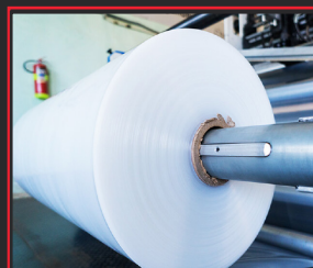
STANDARD PALLET COVER (80X120 AND 100X120)