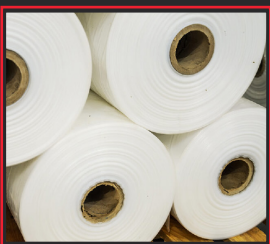
GUSSETED HEAT SHRINK TUBING (AVAILABLE FROM 4 TO 15 M WIDE)